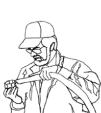
Vacuum and/or blow-out screen and chamber