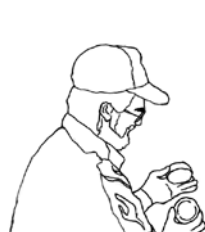
Reinstall or replace screen