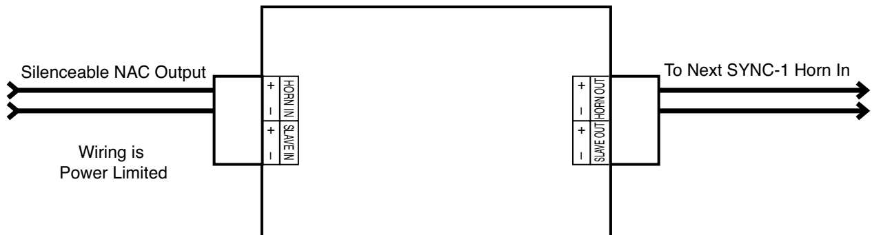
FIGURE 3: HORN OPERATION

All horn and slave wiring interconnecting SYNC-1 accessory cards must be contained within the same enclosure. If multiple enclosures are used they must be located within 20 feet of each other with all horn and slave wiring between enclosures routed inside of conduit. This conduit should be grounded metal containing no other field wiring.