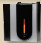
Aspiration FAAST 8100

The aspiration detection system is an ideal fit in Apex Tool Group's hand-tool manufacturing facility because it rejects nuisance alarms caused by dirt and dust.